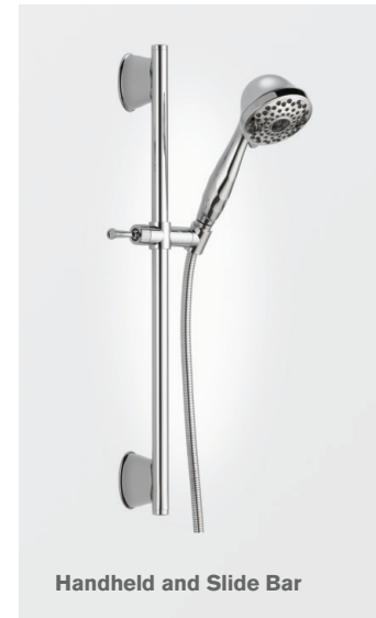
Handheld and Slide Bar