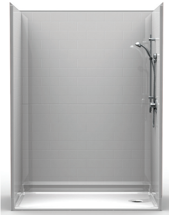
Barrier Free Shower