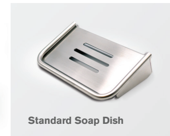
Standard Soap Dish